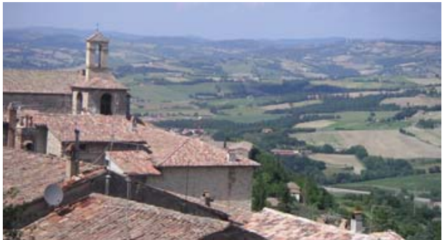
Todi - concert venue on our Umbria tour

We regularly travel abroad and across the UK on tours that offer music making, sightseeing and socialising. Tours are an ideal way to meet people - and sing in some wonderful venues, like the Duomo in Florence. We have toured to Italy (Garda, Venice, Sicily, Tuscany and Umbria), Spain (Granada, Seville and Valencia), Israel, Rhodes, France and Germany, as well as Durham, Newcastle and Cambridge.