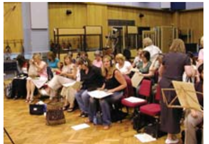
Recording a soundtrack at Abbey Road studios

for more information about the choir visit www.hertfordshirechorus.org.uk