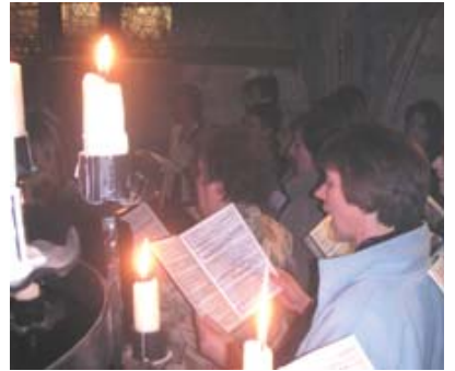
On location with 'Spooks'