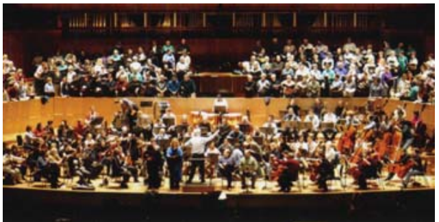
Rehearsing at the Royal Festival Hall

We sing in some of the top venues in the UK with appearances in the Royal Albert Hall, the Royal Festival Hall, the Barbican, Birmingham's Symphony Hall and The Sage Gateshead, as well as concerts in and around Hertfordshire, including St Albans Cathedral.